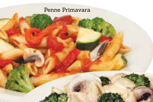
Pasta con Broccoli

Rigatoni alla Carbonara Penne Tutto Mare Chicken Fettuccini