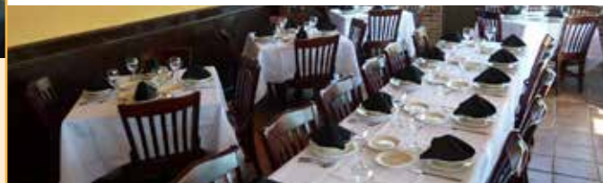
Table cloths available – Ask for details.

Add an appetizer to any listed menu $2 per guest