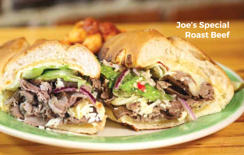
Joe's Special Roast Beef